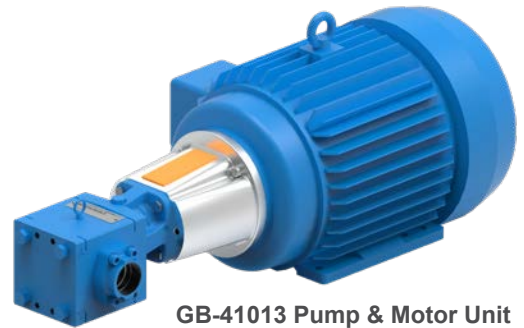
GB-41013 Pump & Motor Unit